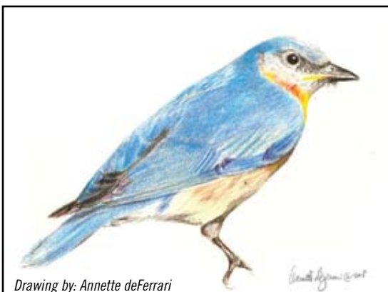
Drawing by: Annette deFerrari